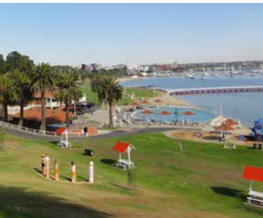
Eastern Beach Reserve

An attractive, spacious garden setting makes Acacia Court a pleasing environment, with the convenience of the large Newcomb shopping precinct within walking distance.